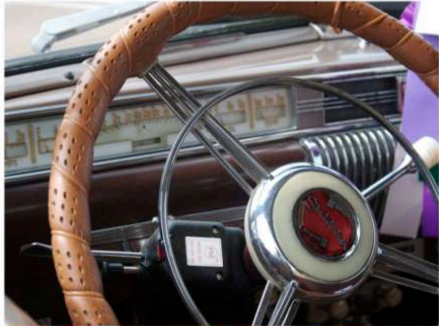
1955 Chevy Bel Air