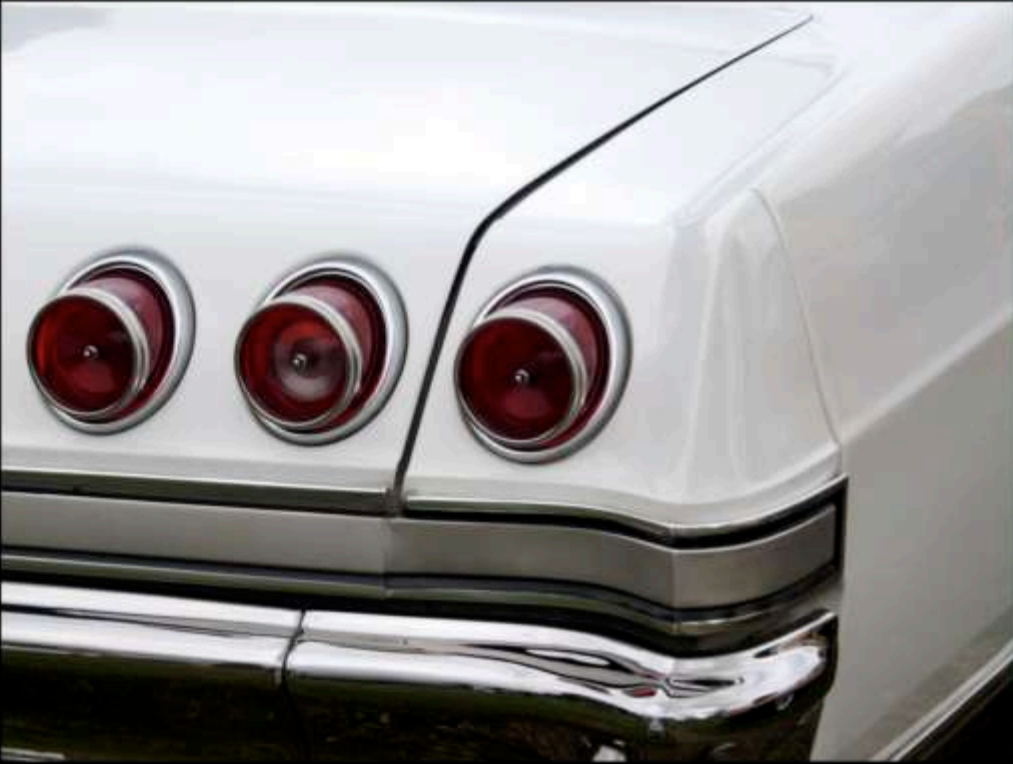
1965 Chevy Impala taillights