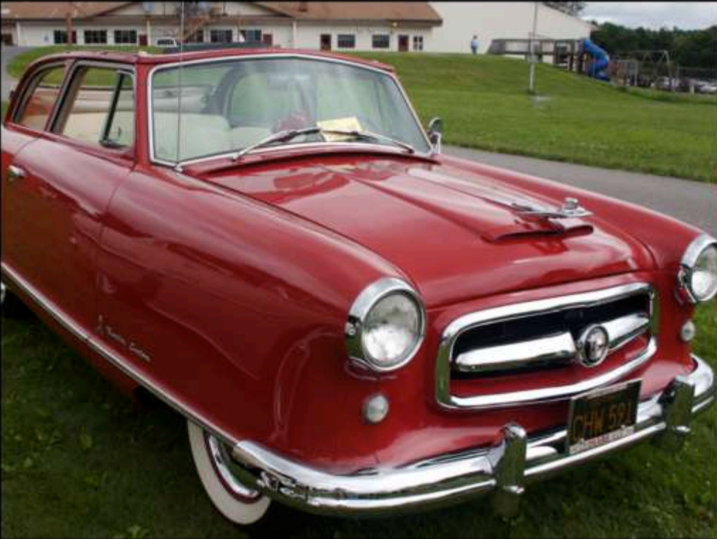
1953 Nash Rambler Custom Convertible

Probably one of your more interesting and odd cars, the Rambler Custom features almost nautical styling.