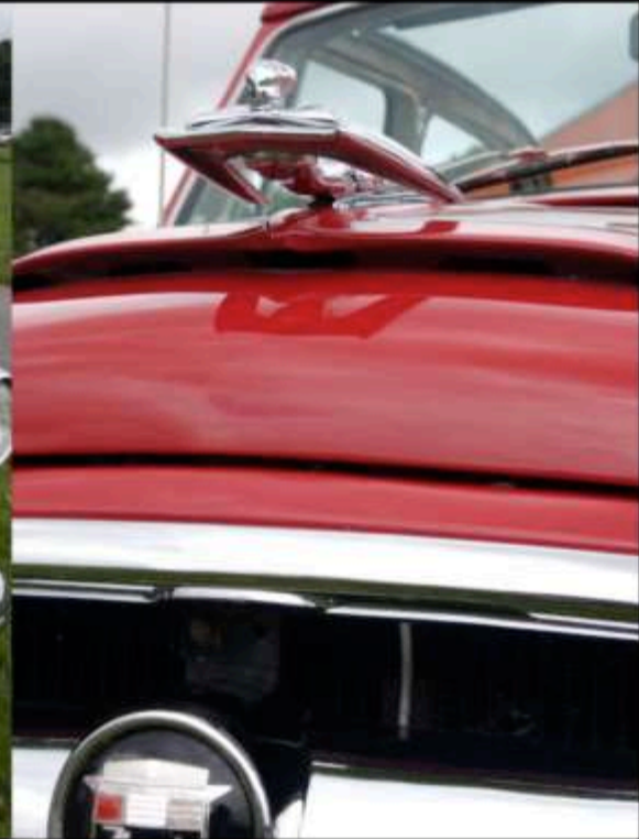
1953 Nash Rambler Custom Convertible