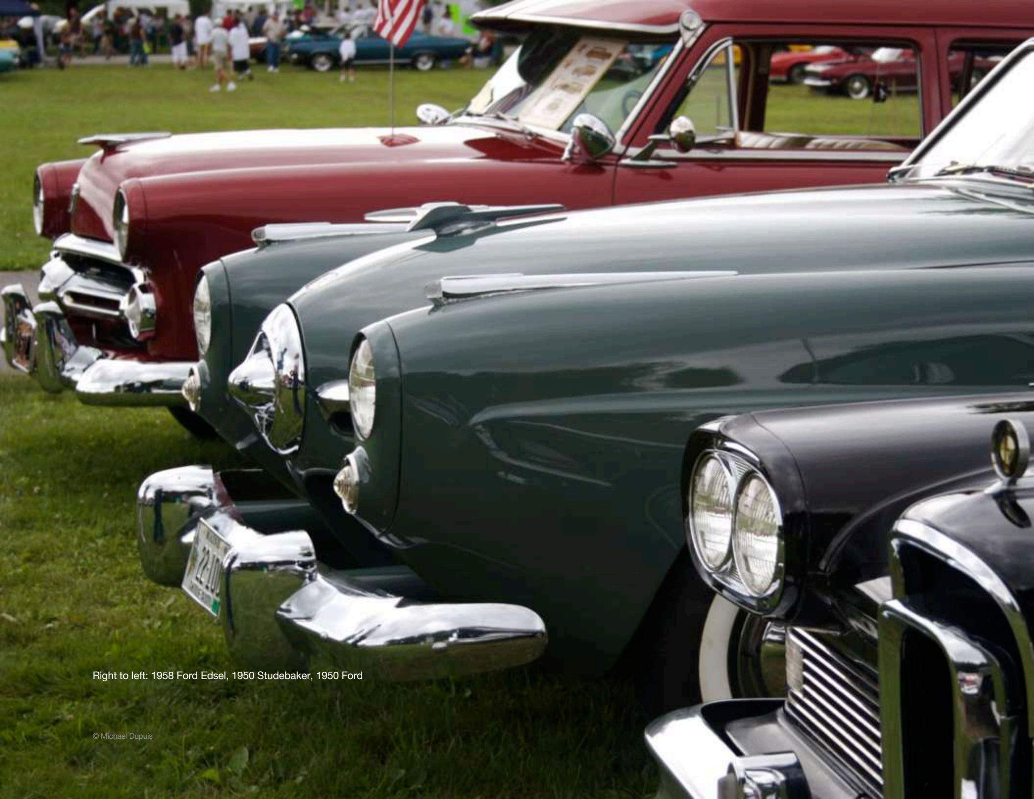
Right to left: 1958 Ford Edsel, 1950 Studebaker, 1950 Ford