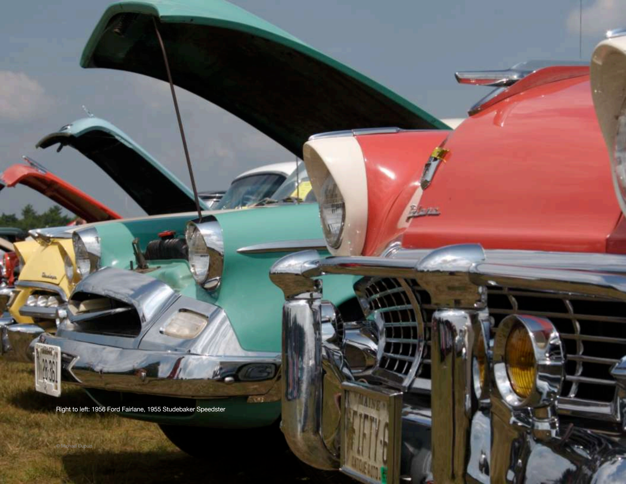
Right to left: 1956 Ford Fairlane, 1955 Studebaker Speedster