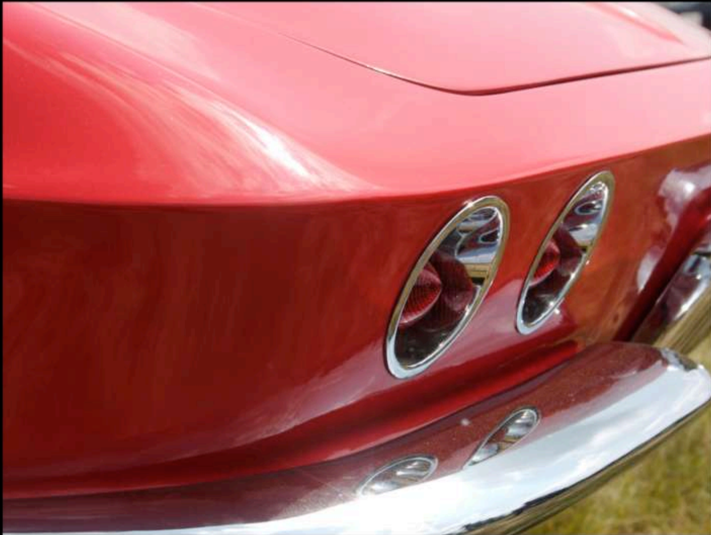
1959 Chevy Corvette Roadster