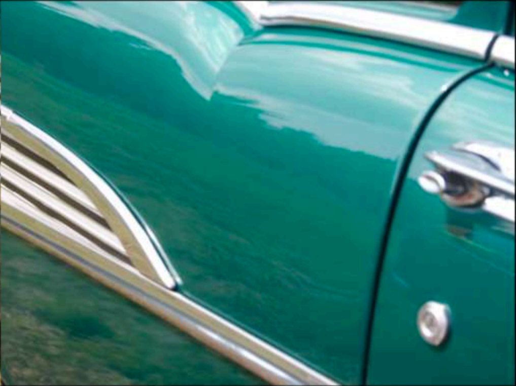
1957 Chevy Bel Air