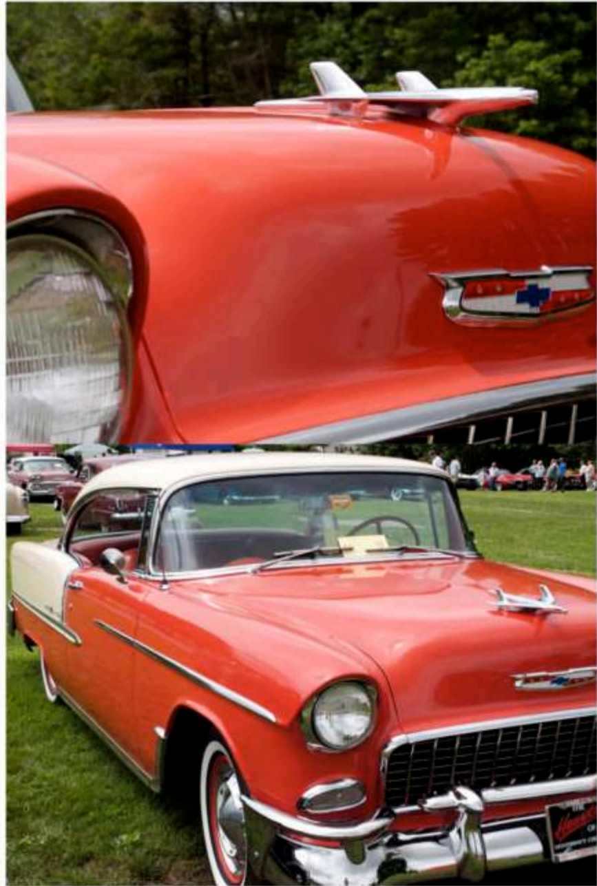
1955 Chevy Bel Air