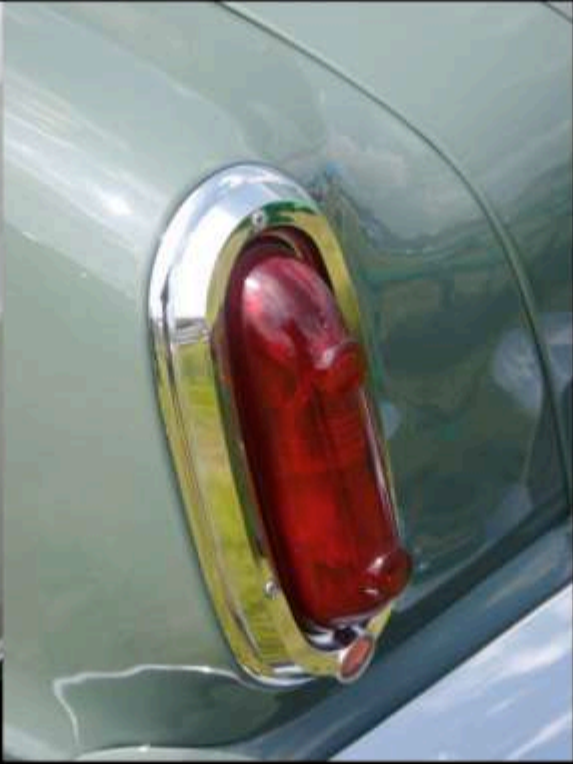
1950 Studebaker taillight