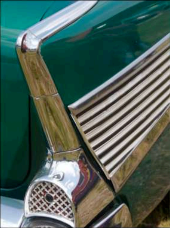
1957 Chevy Bel Air